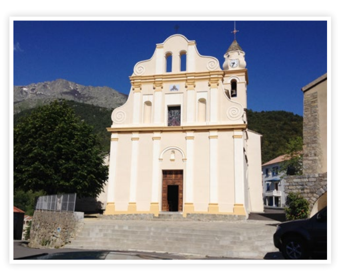
Church in Saint Pierre de Venaco (20)