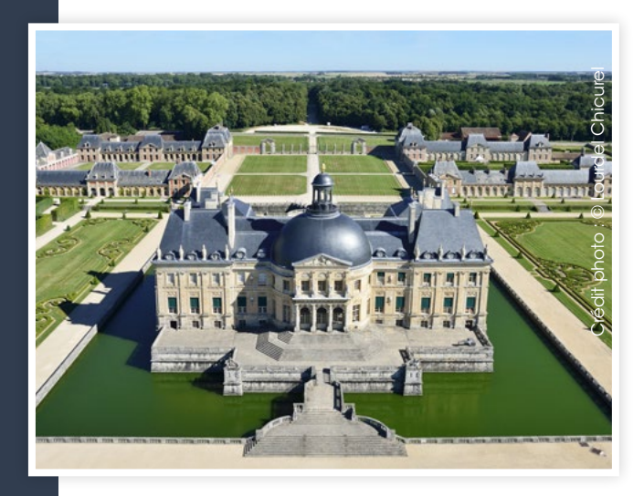
Castle of Vaux-Le-Vicomte Maincy (77)