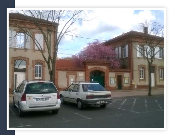
School complex in Carmaux (81)