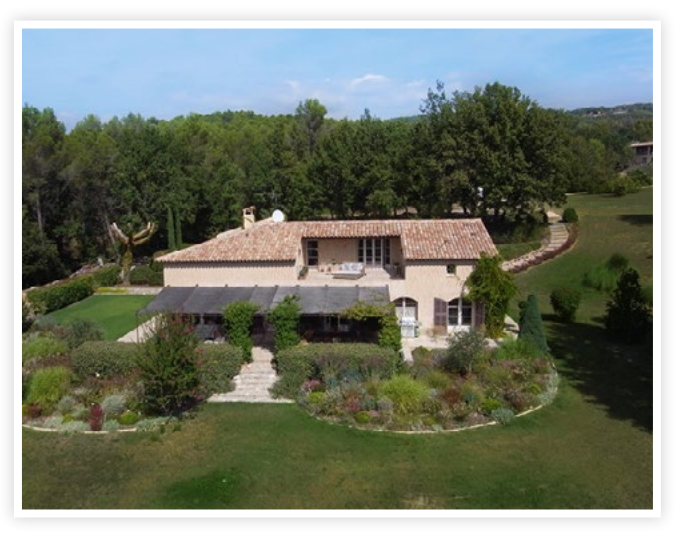
Private home in Villecroze (83)