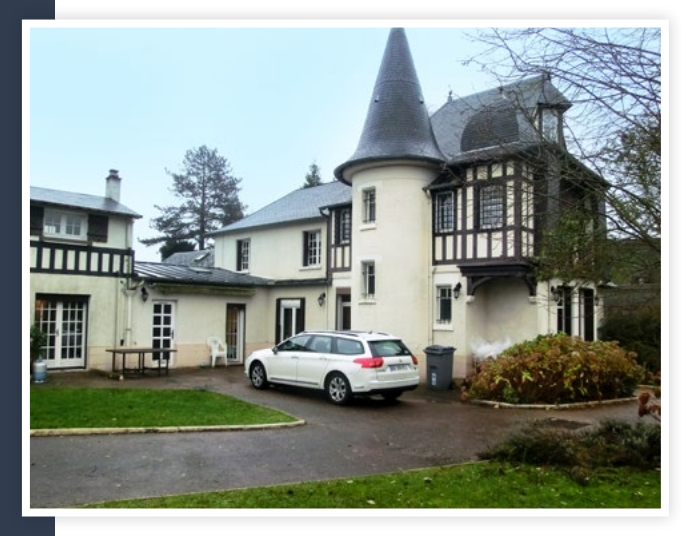
Private home in Rouen (76)