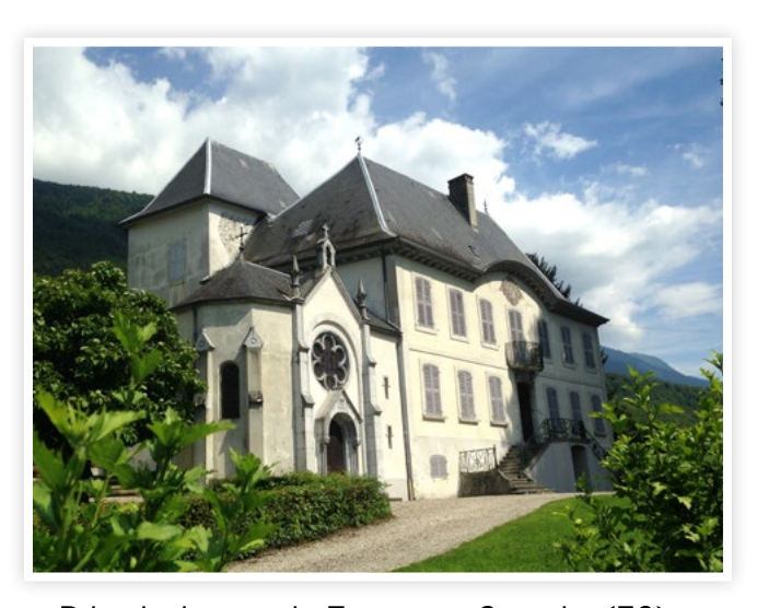
Private home in Tours en Savoie (73)